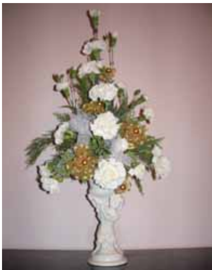
Sandra's entry in "Arrangement with Ribbon and Lace"

To return to the rational world there was also a day spent on the practicalities of setting up public arts projects. How you do them and interestingly what I learnt from the participants was how so much of the problem in getting these sorts of projects off the ground is fear. Fear of the unknown, fear that a monster will be born a big, horrible, ugly thing that will also tie us up in budget over runs, possible law suits, and public outcry, not if you have a plan and a process to follow. Time spent in putting together a plan and a process can and will eliminate the fear, it puts in place a framework so everyone knows what their own role is and what the expectations are - and this is what Pamille demonstrated - how you can do that.