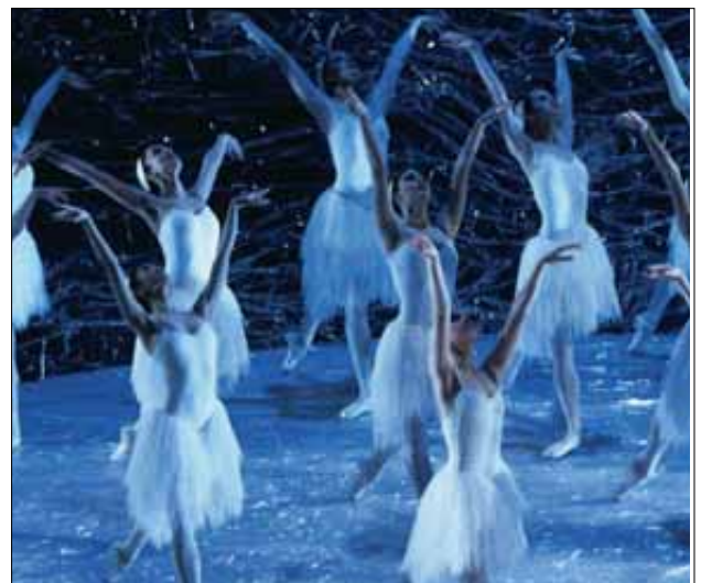
Swan Lake will be screened live via satellite from the Sydney Opera House to the Majestic Cinema.

Come and see the Australian Wife Carrying Titles. The winning couple will receive a trip to Finland to compete at the WORLD Wife Carrying Titles. You don't have to be a married couple to enter, just as long as you bring your sense of fun. 9am - 11 pm Singleton Showground, Bathurst St., Singleton (02) 6572 2039