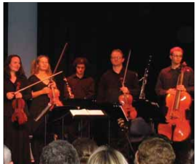
Newcastle Festival Opera.