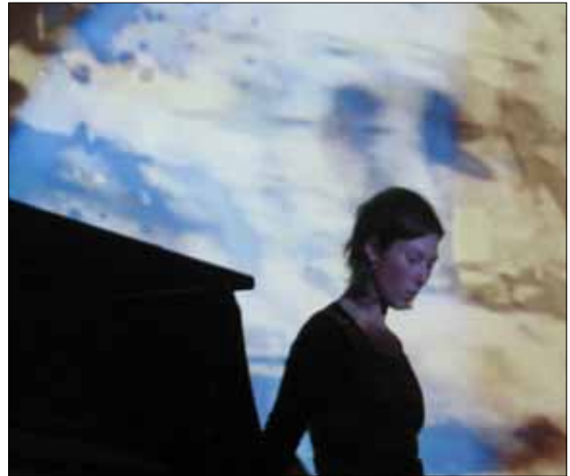
From the Sunwrae Ensemble performance at Dungog.

title of story and word count. Must not be submitted to concurrent competition. $5 entry fee. Sent to: Competition Secretary Stroud Writers FAW NSW Inc, PO Box 4 Stroud. For more details email stroudwriters@yahoo.com.au