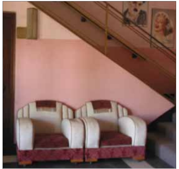
Scone Civic Cinema waiting for an audience.

that it holds. We are going to pursue the future of the building. Since then, the group of keen film enthusiasts have met again and are determining who, what, where and when with films, we hope to be able to attend their first viewing soon!