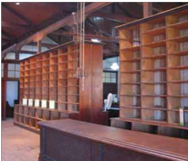
The 'Up to Date Store' Coolamon