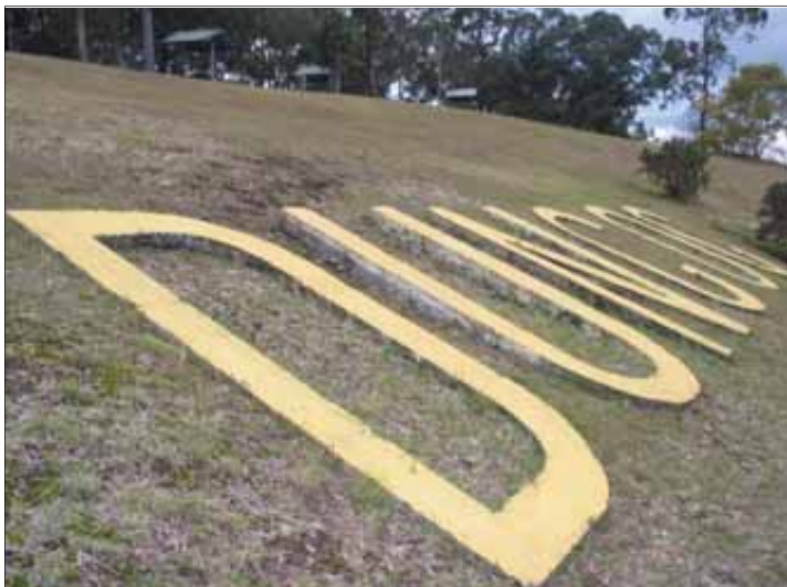
Hollywood Hill, Dungog