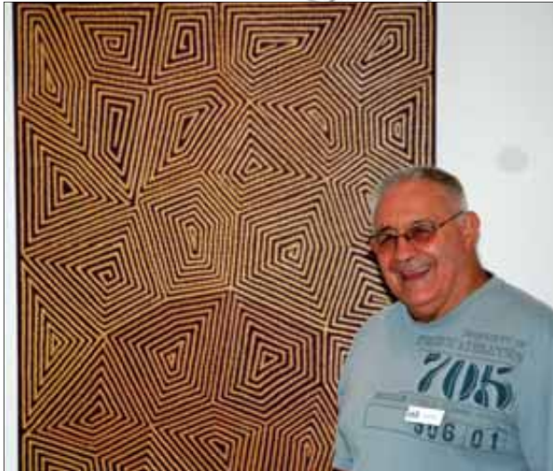
Les Elvin Spirit of the Moonlight 2007 Muswellbrook Shire Art Collection photograph by Kelie Tym 2008 courtesy Muswellbrook Regional Arts Centre.