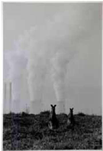
Roger Skinner Roos and Plumes (Proximity) 2001 gelatin silver print Muswellbrook Shire Art Collection

For more grants and artist opportunities, please visit www.artsupperhunter.com.au