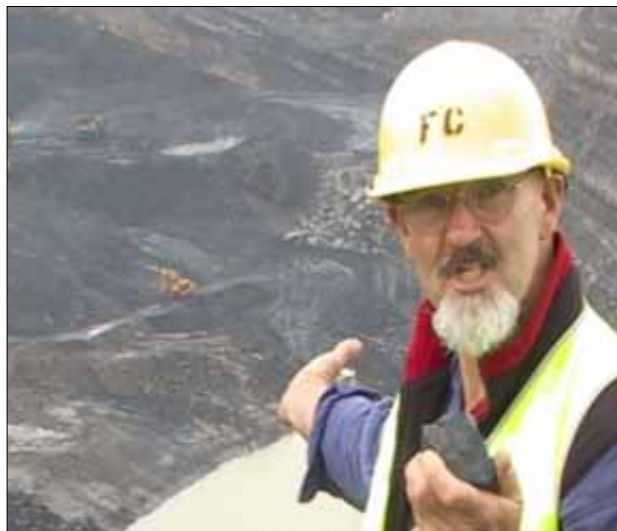
A still from the Portrait's of Place film, What's Yours is Mine...d

For details http://www.hothousetheatre.com.au/amitc/index.htm