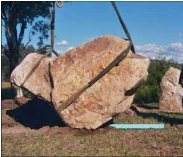
The rocks being delivered for the Sculpture Garden at Sandy Hollow.