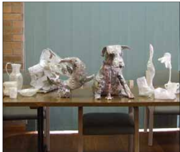
Artworks created at the recent Sticky Tape workshop at Dungog.

A workshop especially for vocalists wishing to develop and integrate their acting and movement skills with their singing. Suitable for professional and amateur singers, actors and dancers alike, workshops focus on "Cross-referencing" the Performing Arts. The workshops run for 3 1/2 hours and is divided into two parts, with two small breaks of 15 mins. The workshops are being organised by the Muswellbrook & Upper Hunter Eisteddfod Committee. Muswellbrook Regional Arts Centre. Bookings essential. For details call Suzie Troon on 6541 2094.