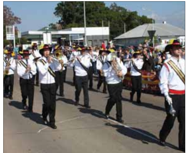
The Upper Hunter Show Band

production type project for young people, that would be an adjunct to the Film Festival and the Turning the Pages project in Murrurundi is planning its next stage. Anyone seeking assistance with the grant process please do not hesitate to contact our office