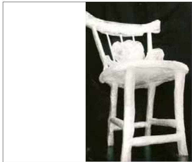
Leanne Barrett, Sticky Tape sculpture 2007