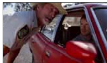
Bryan Brown as country cop Rosco in a scene from the film Cactus.

Majestic Cinema, 21 Ryan Ave, Singleton. Tickets $10 single/$7 each for a group of five or more. For details or to book tickets call the cinema on 6571 5252. Tickets go on sale 7th May.