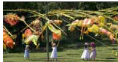
Turning the Pages Revisited