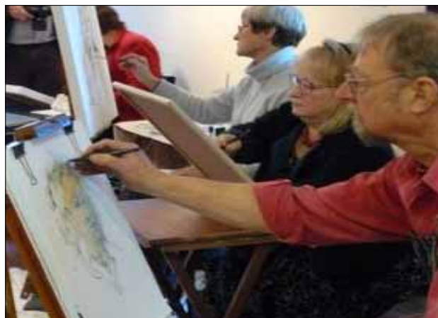
Group of artists working on the National Trust Portrait Exhibition.